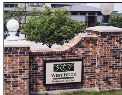
Having backup power for the safety and convenience of its guests give West Wood a competitive advantage.