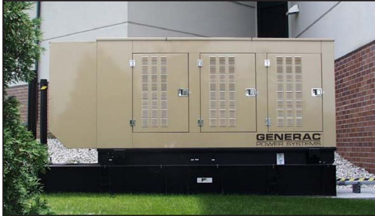
West Wood Health & Fitness Center's 180 kW genset.