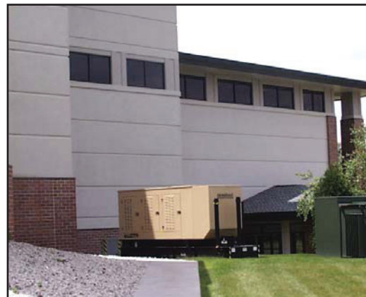
The sound attenuated genset is located alongside the building.

“It was great working with West Wood,” said Mike Lehn. “They let us know what their requirements were, and we proposed a couple of systems with different kilowatt outputs for their consideration. They selected the enclosed 180 kW diesel unit to support their most important electrical circuits, giving them the backup coverage they need.”